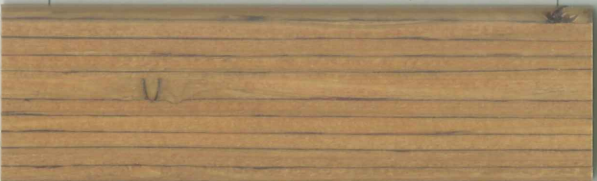
SVL Oregon Pine Birke | Oregon Pine Birch

Translucent colours for SDL Aura | for indoor and outdoor use