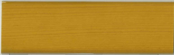
Kiefer 344-2 | Pine 344-2