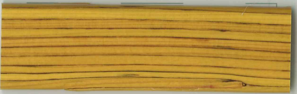
SVL Oregon Pine Esche | SVL Oregon Pine Ash