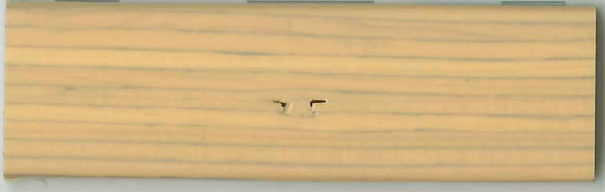
SVL Oregon Pine Buche | SVL Oregon Pine Beech