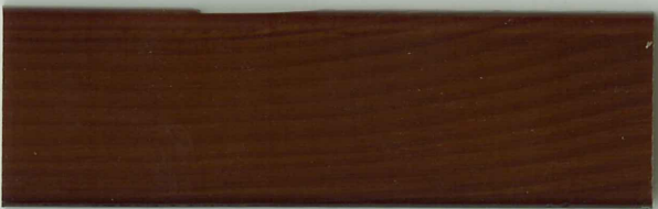
Kiefer 466-2 | Pine 466-2