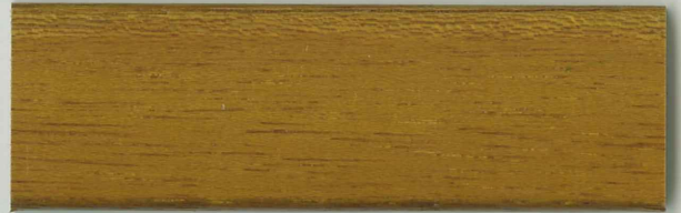
Meranti 344-2 | Meranti 344-2