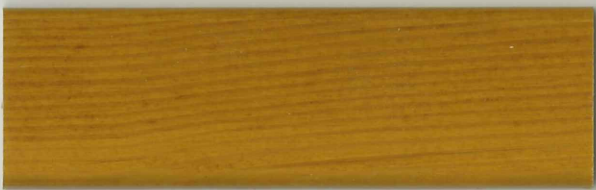
Kiefer 444-2 | Pine 444-2