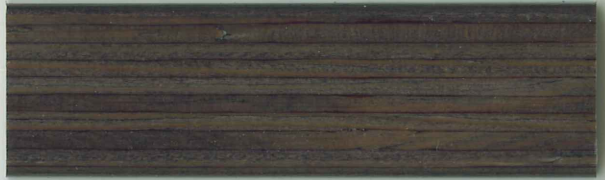
SVL Oregon Pine Steingrau | SVL Oregon Pine Stonegrey

Ein besonderes Merkmal des naturgewachsenen Rohstoffes Holz ist, dass Farbe und Struktur, auch innerhalb eines Profils, geringfügig abweichen können.