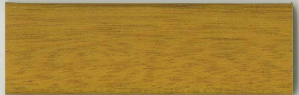
Meranti 333-2 | Meranti 333-2