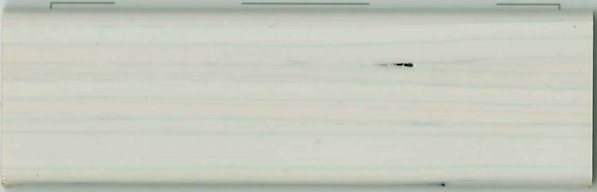
SVL Oregon Pine Perlweiß | Oregon Pine Pearly white