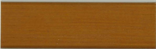
Kiefer 455-2 | Pine 455-2