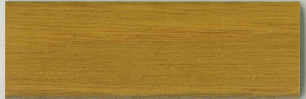
Meranti 322-2 | Meranti 322-2