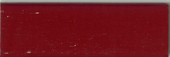
Meranti RAL 3003-2 | Meranti RAL 3003-2