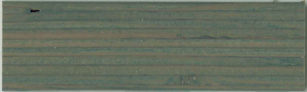
SVL Oregon Pine Patina | Oregon Pine Patina