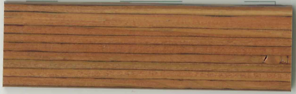
SVL Oregon Pine Padouk | SVL Oregon Pine Padouk