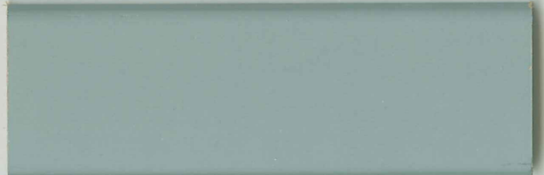
Meranti RAL 7004-2 | Meranti RAL 7004-2