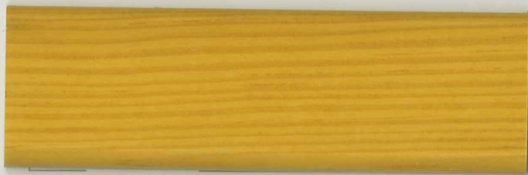
Kiefer 322-2 | Pine 322-2

Translucent colours for wood elements | for indoor and outdoor use