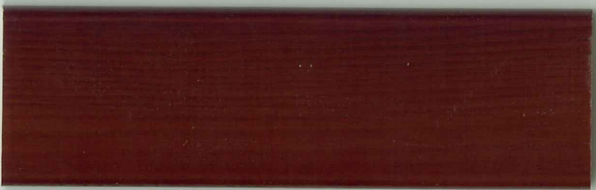
Kiefer 488-2 | Pine 488-2