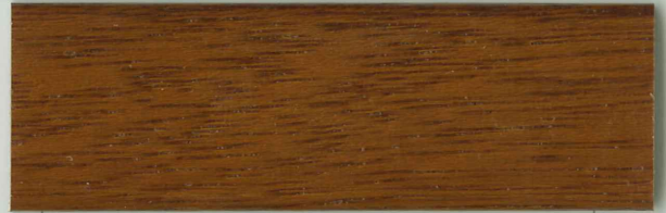
Meranti 455-2 | Meranti 455-2