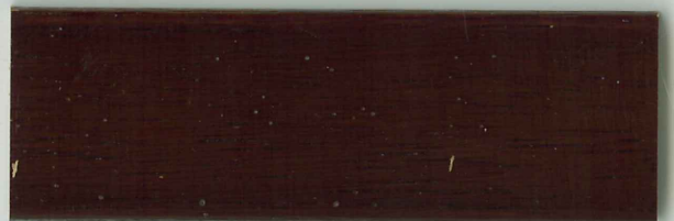
Meranti 466-2 | Meranti 466-2